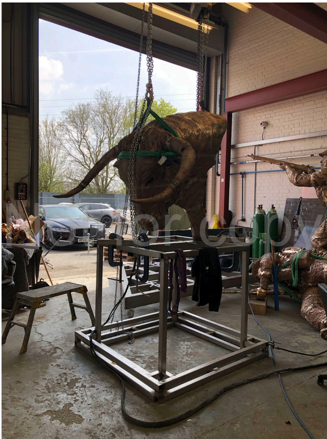
Image is taken of work in progress of the bronze casting stage. (The pieces is yet to have a patina applied and the steel plinth is due to be clad with sheet steel)