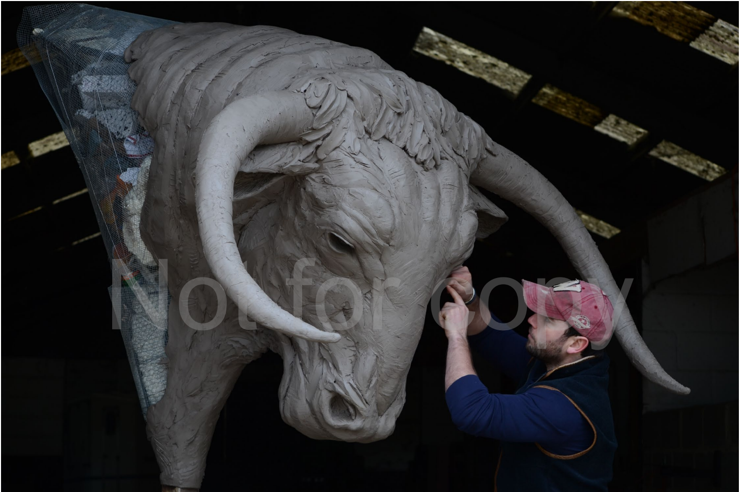
Image is taken of work in progress on the monumental bulls head before bronze casting and manufacture.